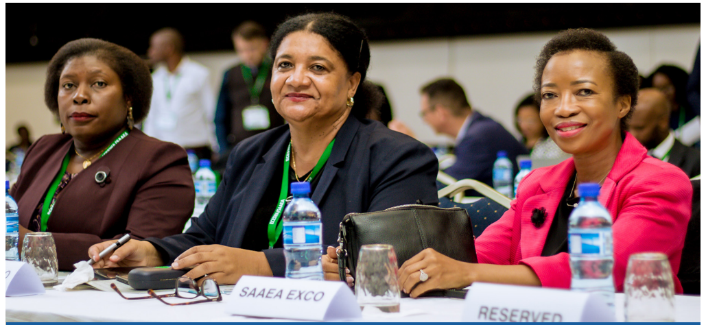
Attentive faces: The SAAEA EXCO listens intently as the new chairman delivers his inaugural speech.